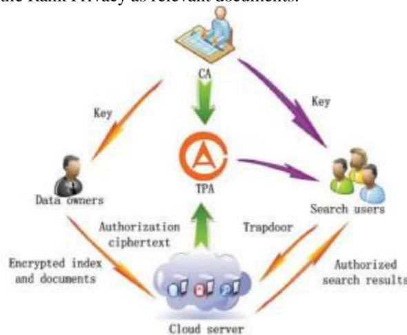
Fig No 1. Hash Sub Tree Designed